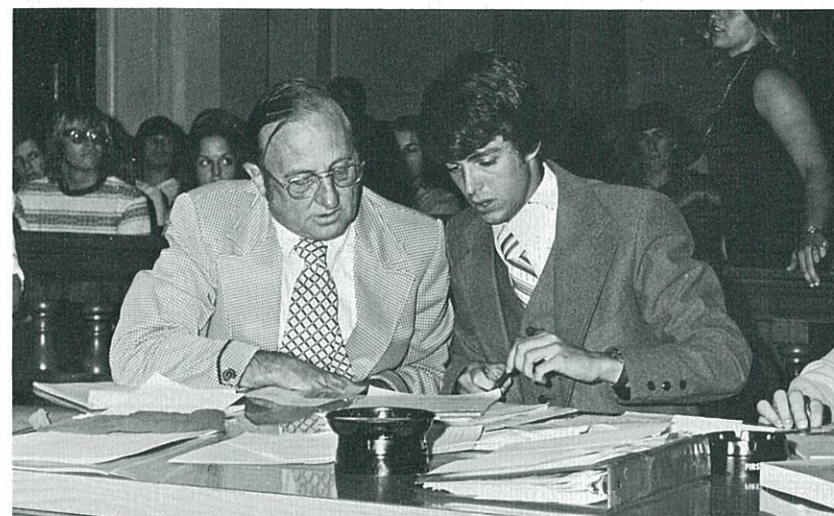
The two Counselors Confer.