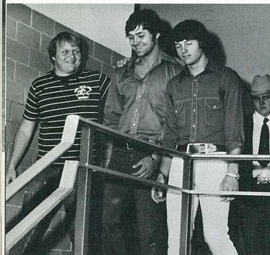
Newman and King are apprehended.