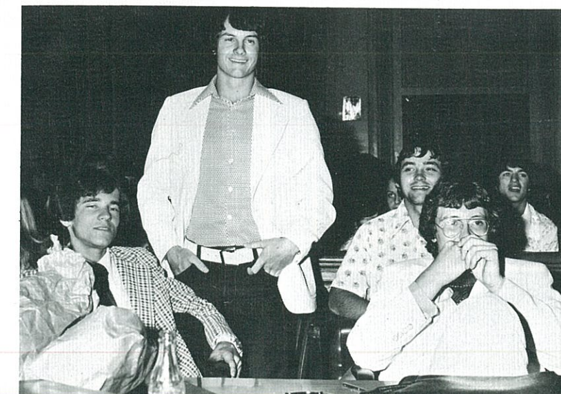
When can I appeal?