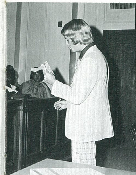
Ladies and Gentlemen of the jury . . .