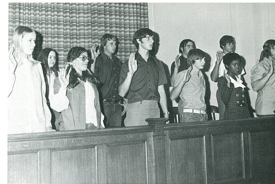
We swear to do our duty as jurors . . .