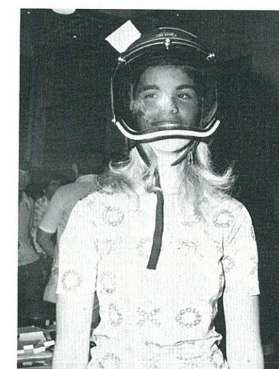
A suspicious looking character!