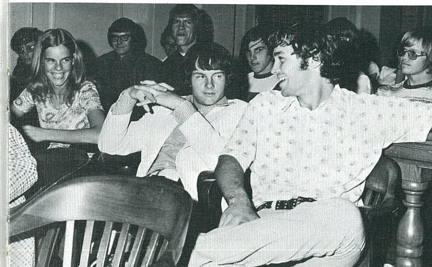
They'll never convict us!