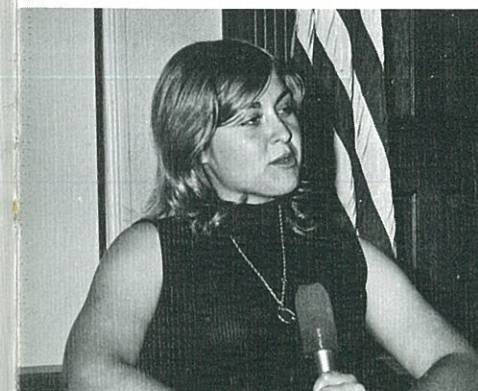
State's Star Witness?